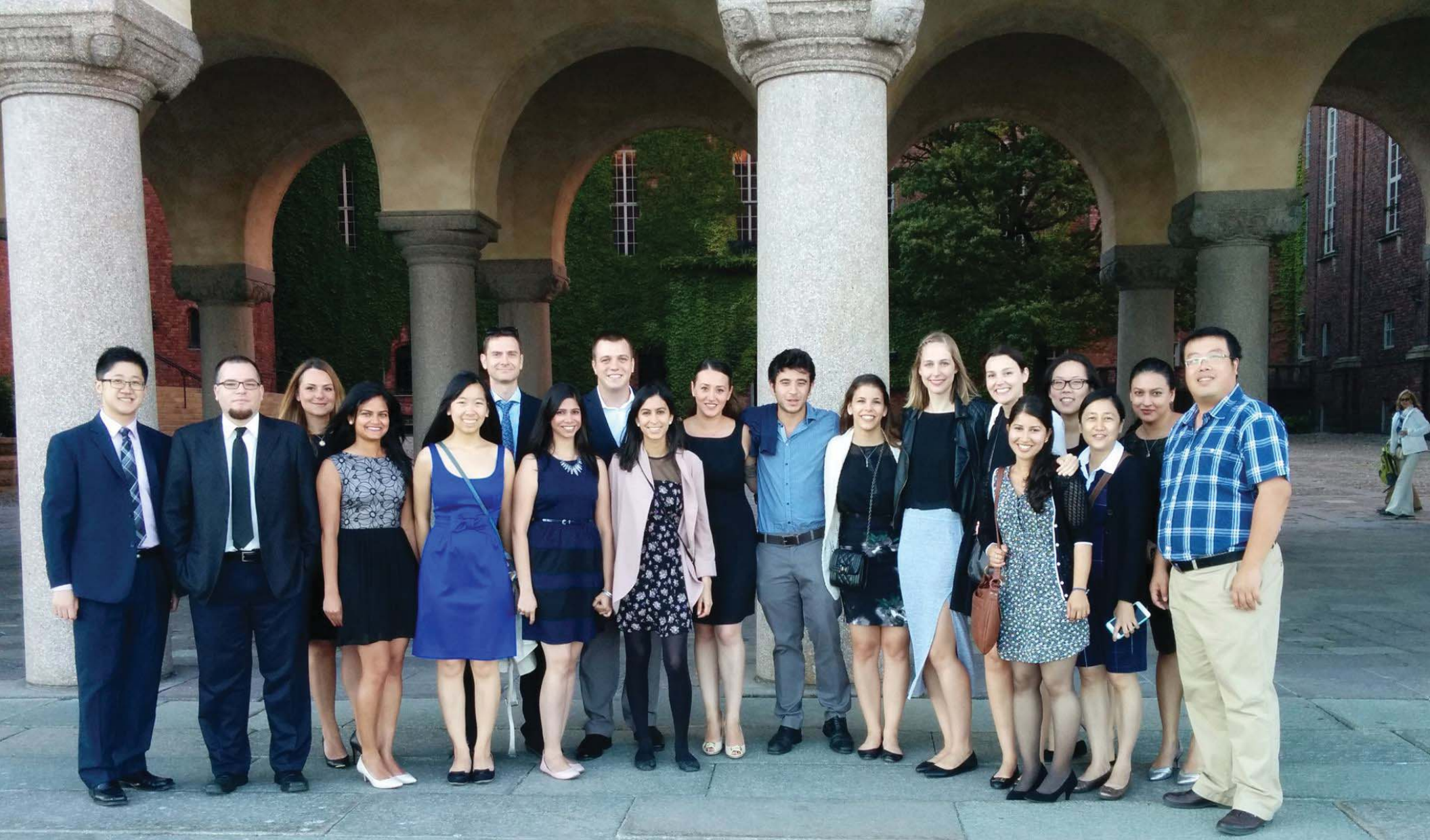
Developmental & Perinatal Biology 2013-2015 University of Toronto & Karolinska Institutet